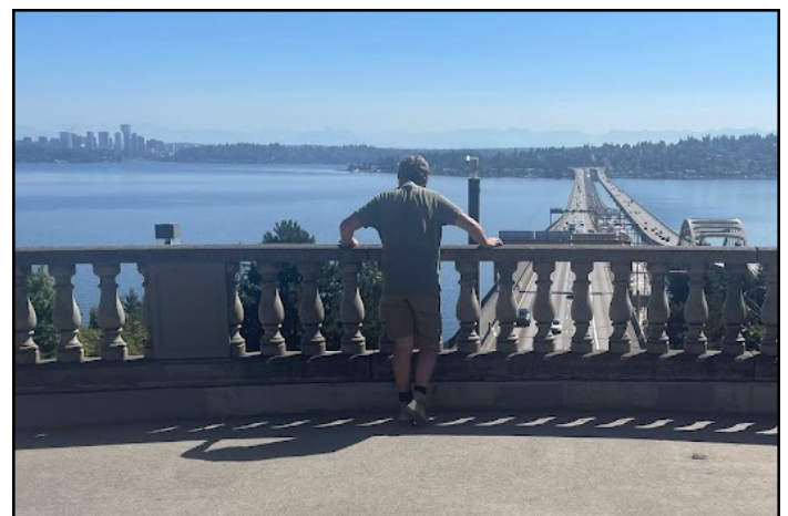
I-90 Floating Bridges Overlook