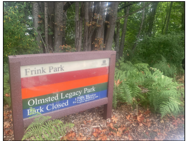
Frink Park